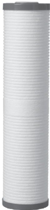
AP810-2 / AP811-2